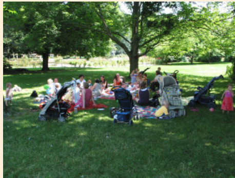
2002 Parent Support Group Picnic

The Parent Support Group has planned workshops and presentations for the rest of the year. Below is a list of what is planned: