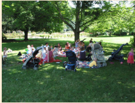
2002 Parent Support Group Picnic